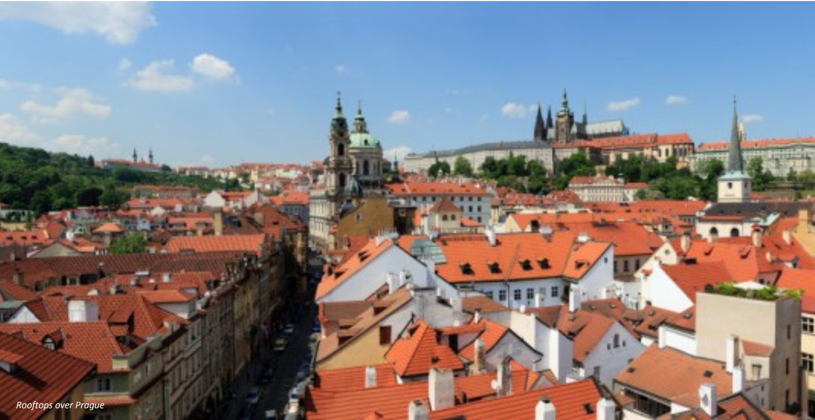
Rooftops over Prague